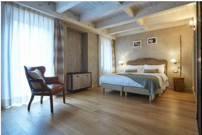
One of the bedrooms at Villa Miraglia

Overnight Villa Miraglia. This is a mountain chalet style hotel in the heart of the Nebrodi park.